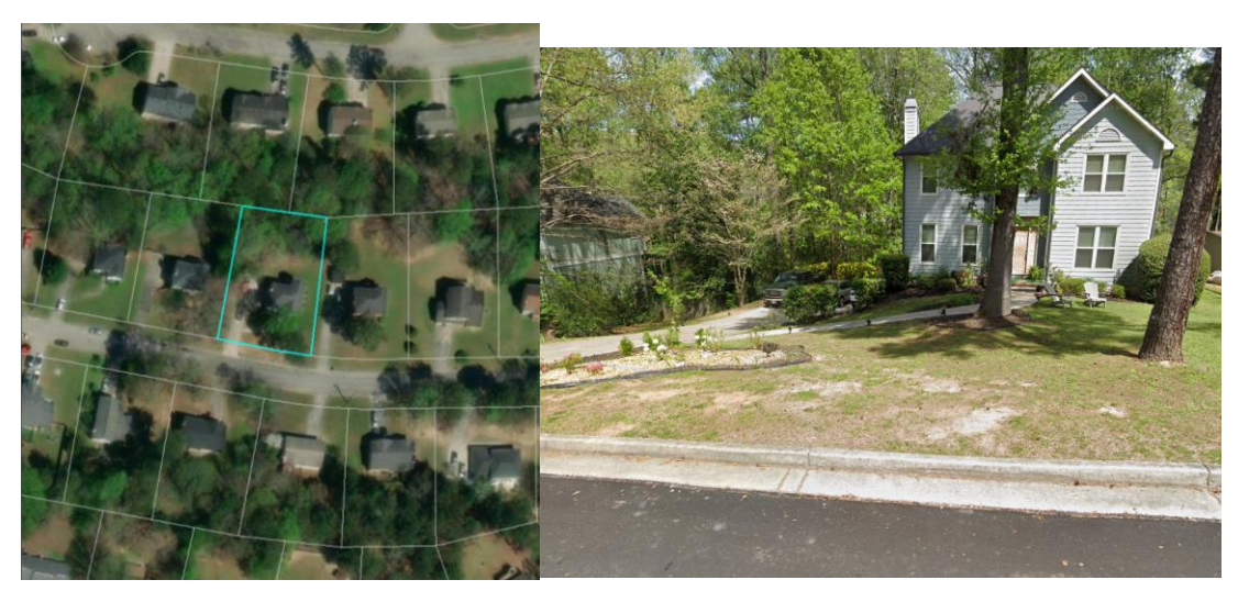
Street View and Submitted Site Plan-